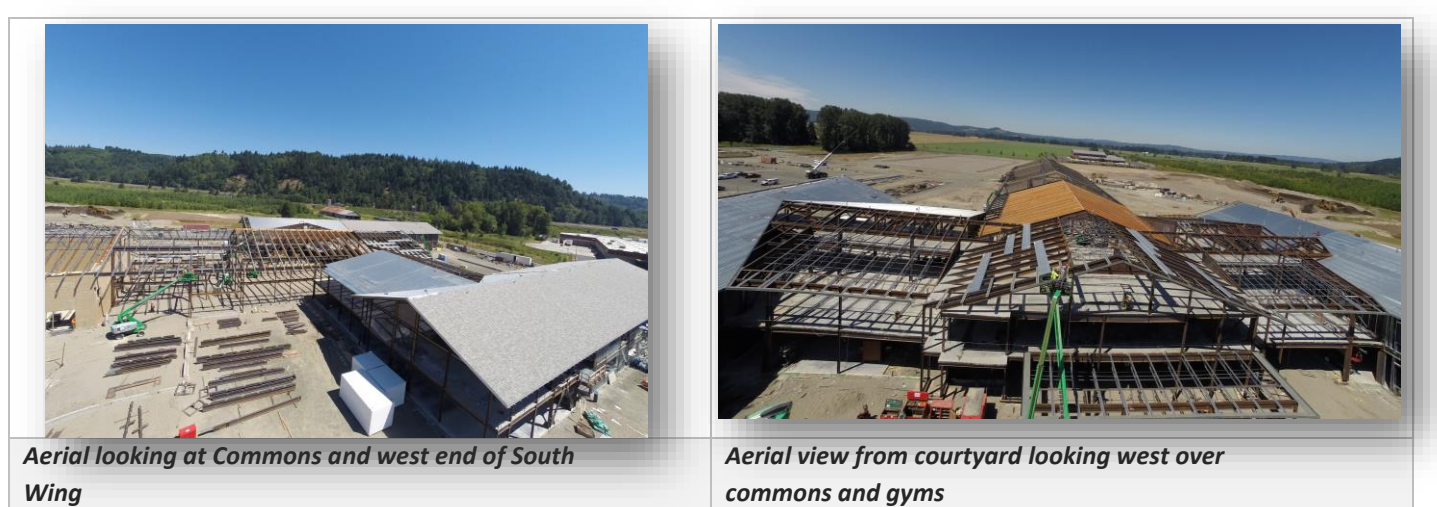
commons and gyms